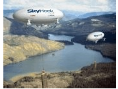
Skyhook JHL-40. See page 4