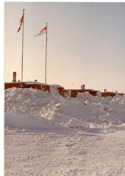
Spring at Alert, Ellesmere Island. That white stuff is not snow but wind-driven ice pellets. See pages 6-7.